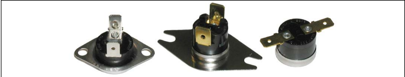
Figure 2. 2450R/2450HR/2455R/2452R/2452HR Series Phenolic Automatic Reset Thermostat

The 2450R/2450HR/2455R/2452R/2452HR Series is a single pole, single throw, snap-acting, non-adjustable thermostat which may be used in applications such as power supplies, general appliances and medical equipment. A temperature-sensitive bimetal disc, electrically and thermally isolated from the switch, is used to actuate the normally-closed contacts. Contacts open when surface or ambient temperatures increase to the operating set point of the calibrated bimetal disc. The entire switch is enclosed in a phenolic housing; the bimetal disc is retained by a metal heat-conducting end cap. Due to the small size of this unit and the inherently low mass of the bimetal snap-action disc, response of this thermostat to temperature changes is extremely rapid, compared to other commercially available thermostatic devices. A variety of mounting brackets and terminals are available.